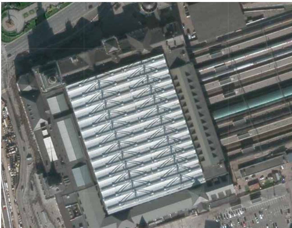
Pic. 1. Space image of Kazansky railway station (Google map).

transport. This led to integration of remote sensing methods and geoinformatics [21]. The basis for integration is geodata.