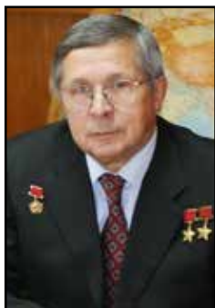
Victor P. SAVINYKH