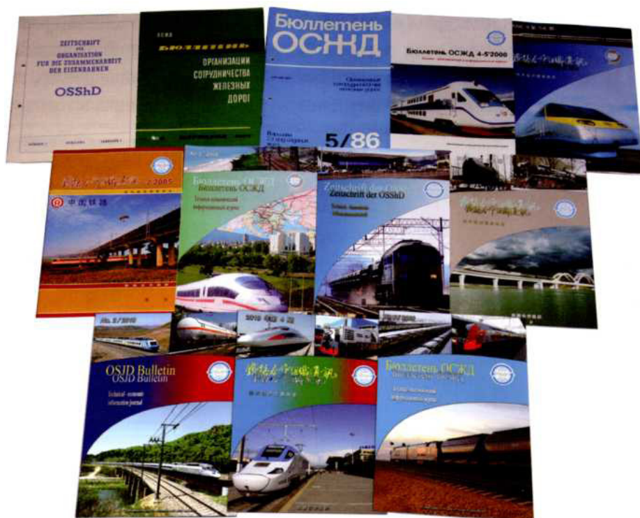
Pic. 3. Front covers of the issues of OSJD Bulletin of previous years.

level specialists of various OSJD commissions and PWGs from various countries, makes an invaluable contribution to the preparation, publication and further distribution of materials during various events in all corners of the Eurasian space. Of great importance and value is the contribution of the OSJD Committee members, representatives of the ministries and railways of the OSJD member countries, observers and affiliated enterprises, cooperation partners from other international organisations – UNECE, UNESCAP, EU (DG MOVE), OTIF, CIT, EAEU, CSZT, UIC, ERA, CCTT, WCO, UPU, FIATA, FTE, FERRMED, ECO, etc., from other publishing houses of the Eurasian space – Bahnfachverlag (Germany), Gudok, RZD-Partner, Eurasia-Vesti, Railways of the World, World of Transport and Transportation, Innovations of Transport, Educational and Methodological Centre for Railway Transport (UMC ZDT) (Russia), Zheleznopoten Transport (Bulgaria) and others.