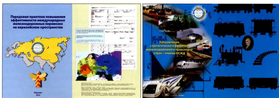
Pic. 6. In 2014 and 2016, the OSJD Committee published two collected works with articles and materials under the titles «Best Practices for Improving the Efficiency of International Railway Transport in the Eurasian Space» and «Directions for the Strategic Development of Railway Transport in the OSJD Member Countries».

observers and affiliated enterprises, subscribers, as well as forwarded within the framework of information exchange to other international organisations and publishing houses dealing with the railway transport industry – in total it is distributed in more than 50 countries of the world.