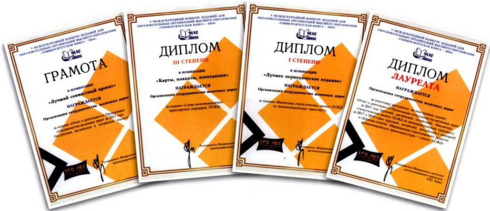
Pic. 9. Awards for OSJD for the best printed periodicals in foreign languages in the field of «Material and technology of land transport».