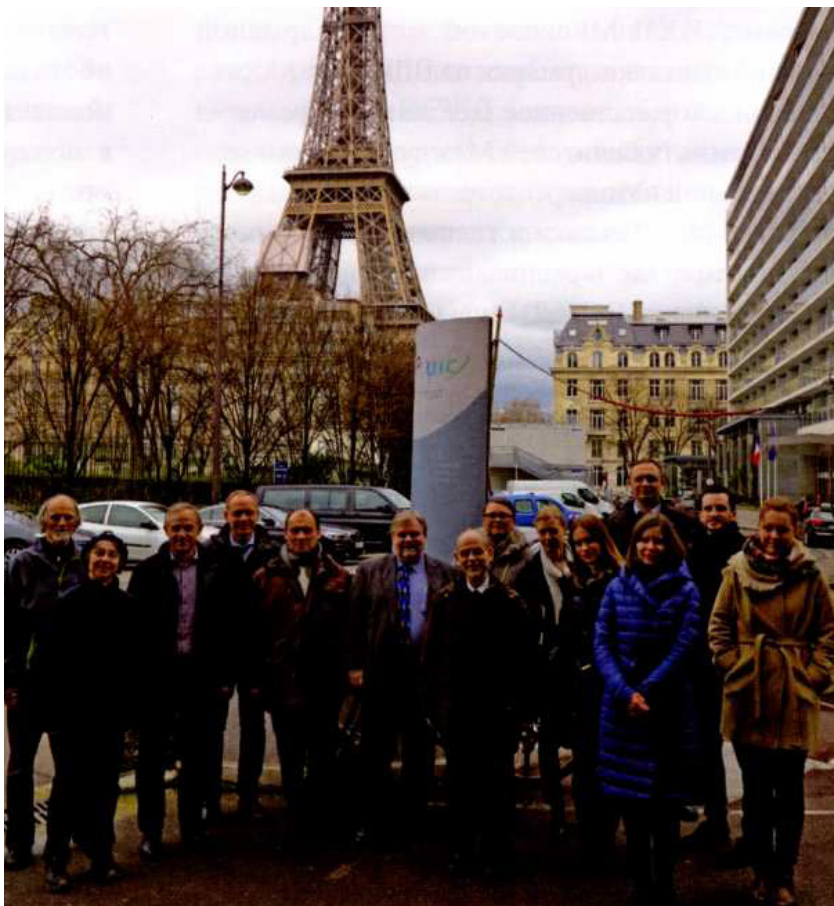
Pic. 11. Participants in the joint meeting of the UIC-OSJD Terminology Group (Paris, October 2015).