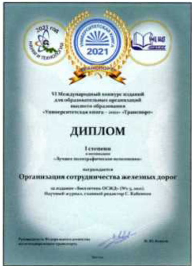
Pic. 10. Diploma of the 1st degree in the nomination «Best in Printing Quality» following the outcomes of the VI International Competition of periodicals «University Book – 2021 / Transport».

where the Organisation for Co-Operation between Railways (OSJD) was awarded highranking awards and won the title of laureate in the field of publishing specialised railway periodicals in foreign languages (Russian, Chinese and English), including: «Report on the Activities of the Organisation for Co-Operation between Railways», the journal «OSJD Bulletin» and a collection of articles and works «Directions of Strategic Development of Railway Transport in the OSJD Member Countries».