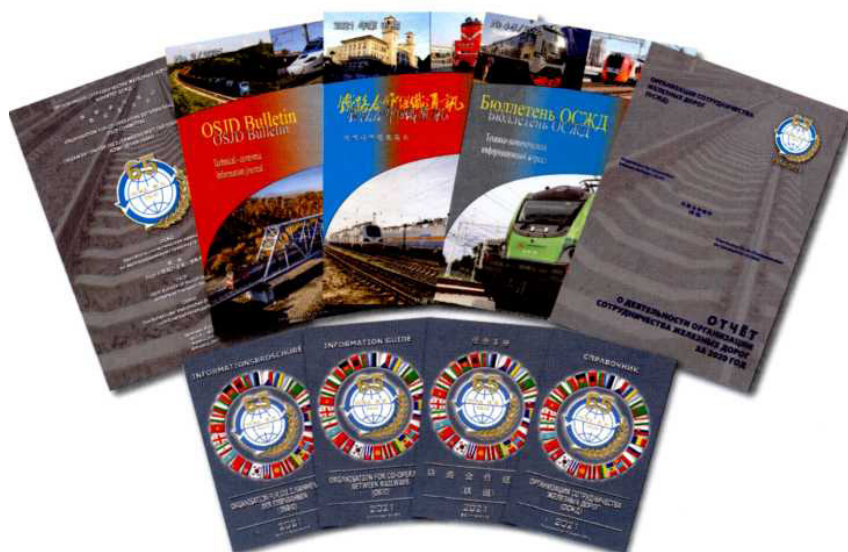
Pic. 5. Editions published by OSJD Bulletin.