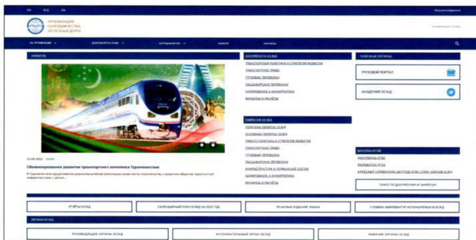
Fig. 4. Home page of the OSJD Website, supported in Russian, Chinese and English.

6 times a year with the following information related to: