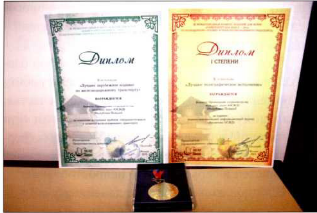
Pic. 8. Diplomas of the 1st degree and a medal awarded to the OSJD Committee as a winner in the III International Competition «University Book – 2015».