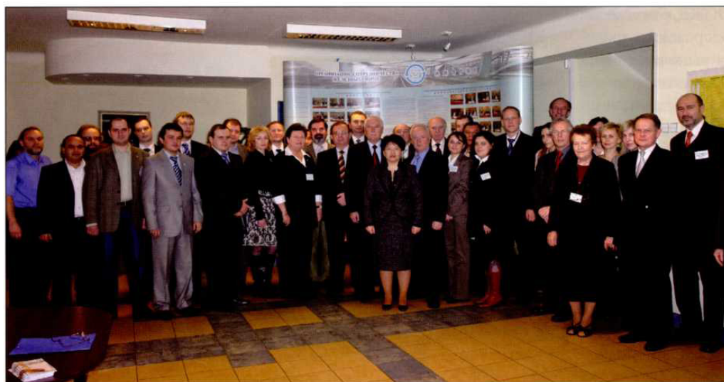
Pic. 7. Participants in the jubilee meeting of the Editorial Board of the OSJD Bulletin journal and in the international workshop on the subject «Role of Specialised Railway Periodicals in the Development of Railways», dedicated to the 50 th anniversary of the journal foundation and publication of its 300th issue (08-09.12.2008, OSJD Committee).

the railway publishing houses of the OSJD member and observer countries.